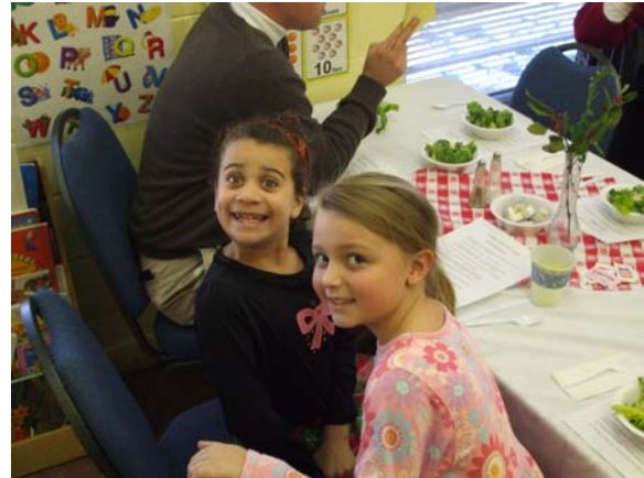
Smile for the camera!